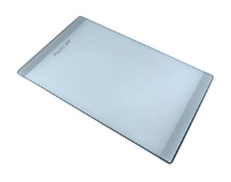
Glass chopping board 8631 300